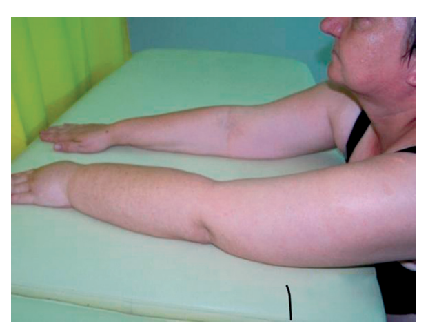
Figure 1. Lymphoedema of the upper extremity on the left side

which it is formed as a filtrate of blood plasma into the blood veins. Creation of lymph is dependent on the function of capillary vessels. The lymphatic system is responsible for the fluid balance in the body. Ninety percent of the volume of the creating filtrate comes back into the blood system from the intercellular space through blood venous vessels, and remaining 10% through lymphatic vessels. In this way, the lymphatic system facilitates the circulation of the blood plasma proteins. Under pathological conditions the concentration of proteins exceeds the transport capabilities of lymphatic vessels leading to the stagnation of proteins in the tissue. As a result of these actions, activating fibroblasts, keratinocytes, and fat cells leads to the deposition of collagen in the skin and subcutaneous tissue, and consequently to hypertrophy and fibrosis of the skin. Abnormal flow of lymph favours the development of an inflammation process and leads to the reduction of immunity [4, 5].